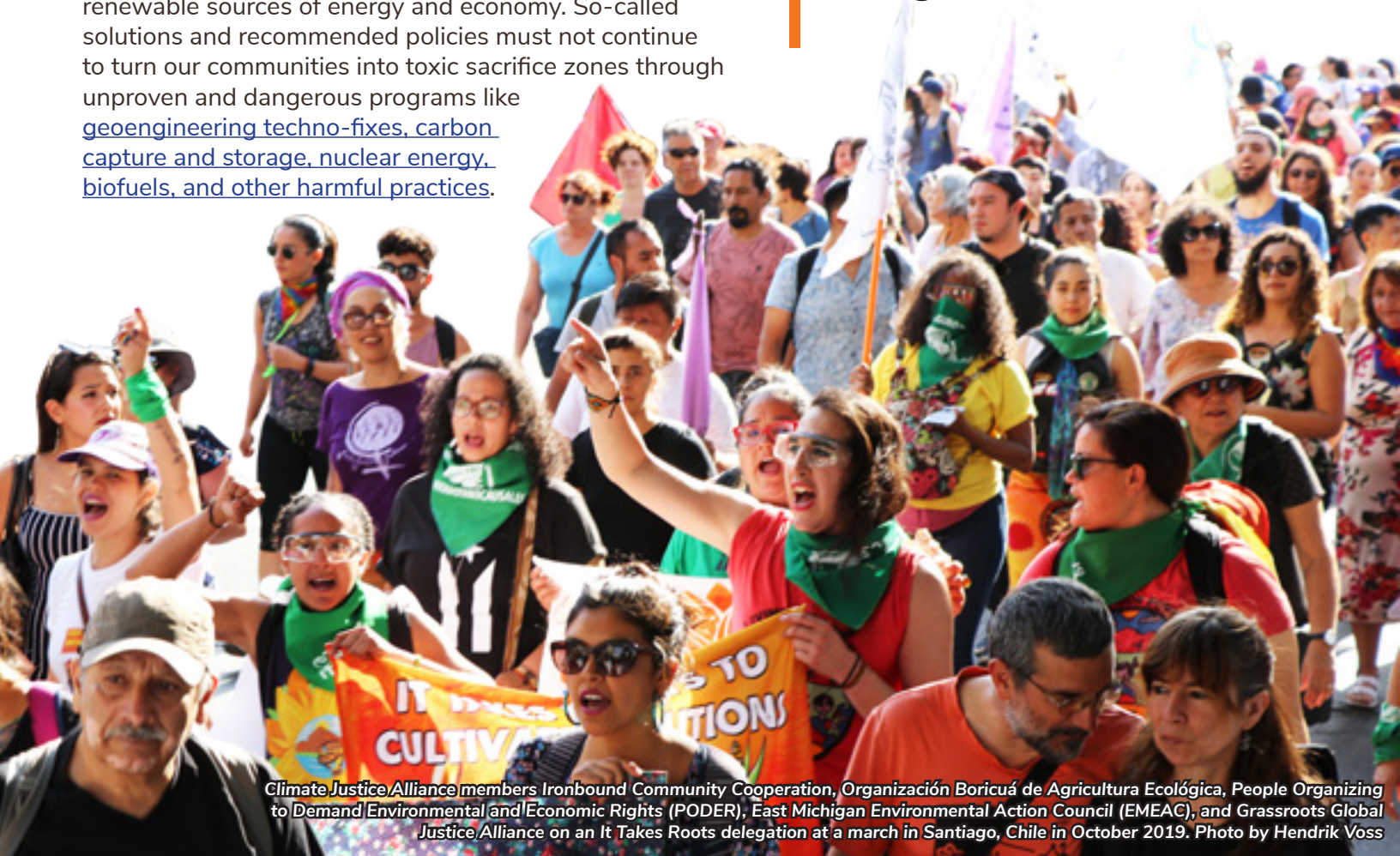
Climate Justice Alliance members Ironbound Community Cooperation, Organización Boricúa de Agricultura Ecológica, People Organizing to Demand Environmental and Economic Rights (PODER), East Michigan Environmental Action Council (EMEAC), and Grassroots Global Justice Alliance on an It Takes Roots delegation at a march in Santiago, Chile in October 2019.

If we want to address climate change we need to move toward zero emissions, not net zero , and reduce emissions at source. Real solutions must put an end to the extractive economy while fostering a Just Transition to locally-based, regenerative economies.