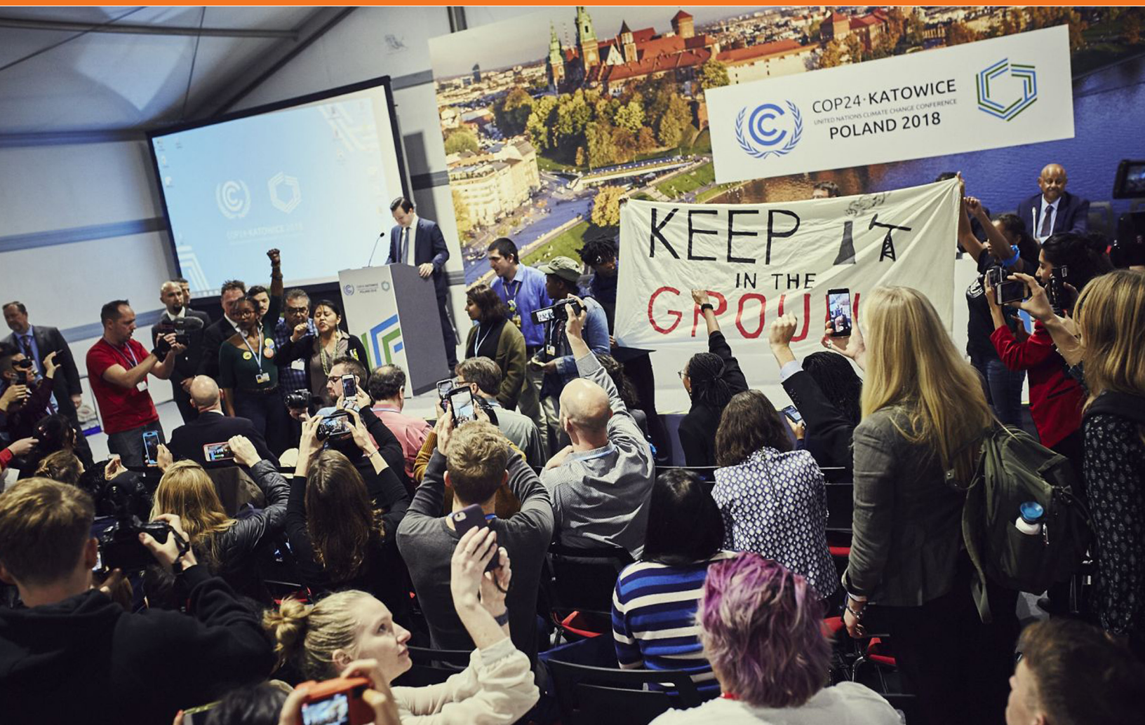
Direct Action intervention during the US administration's COP24 panel, which pushed for the continual use of dirty energy, Poland in 2018. Click here to watch a video of the take-over.