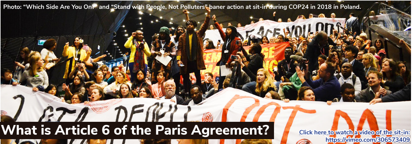
Photo: "Which Side Are You On?" and "Stand with People, Not Polluters" banner action at sit-in during COP24 in 2018 in Poland.